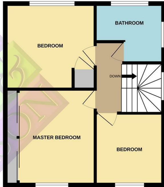
TOTAL FLOOR AREA : 1280sq.ft. (118.9 sq.m.) approx.

Whilst every attempt has been made to ensure the accuracy of the floorplan contained here, measurements of doors, windows, rooms and any other items are approximate and no responsibility is taken for any error, omission or mis-statement. This plan is for illustrative purposes only and should be used as such by any prospective purchaser. The services, systems and appliances shown have not been tested and no guarantee as to their operability or efficiency can be given. Made with Metropix ©2024